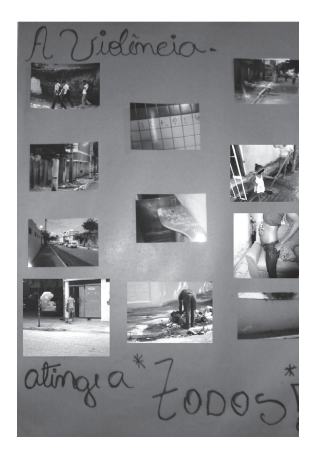
Figure 1 - Panel of photos regarding what the adolescents thought represented situations of violence, prepared by the first group of adolescents from the Culture Circle

Thus, the first group built the following panel (Figure 1):