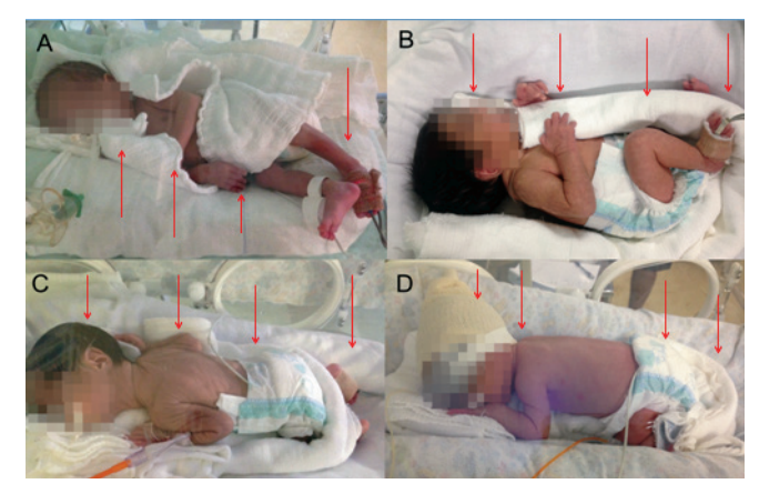
Figure 2 – Cardiopulmonary, behavioral and pain response of the Unit Routine Decubitus and Standard Operating Procedure groups (intervention), Cascavel, Paraná, Brazil, 2016

Note: A and B: Lateral decubitus - URD and SOP PREEMIE (intervention), C and D: Ventral decubitus - PREEMIE of URD and SOP (intervention).