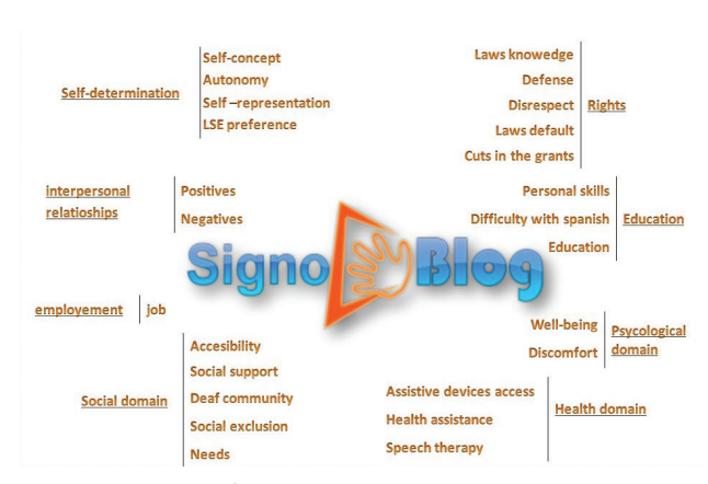
Figure 2 – Conceptual map

in Language and Communication Disorders of the University of Salamanca) were asked to validate the categories extracted from the discourse of the various sign posts. Based on the suggestions made by the experts and with the use of the NVIVO10 computer program, a conceptual map was constructed by integrating information units, metacategories, categories and subcategories that serve as the basis for the analysis of the content (see Figure 2).