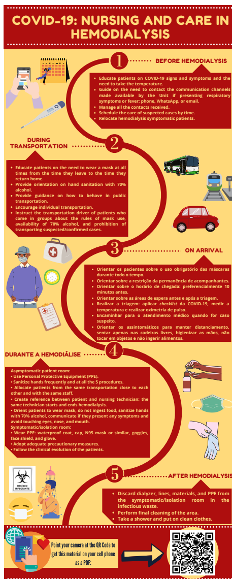
Figure 5 – Patient Timeline