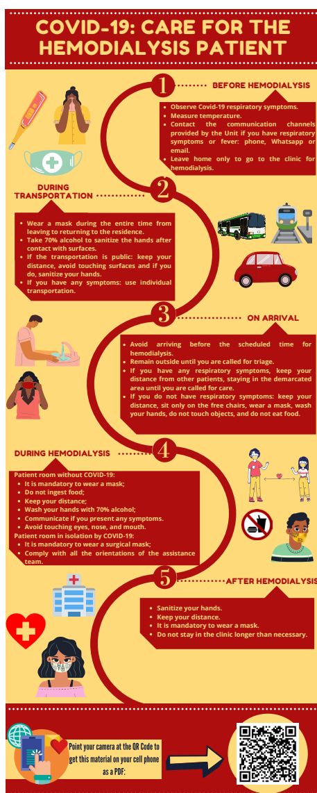
Figure 4 – Nursing Timeline