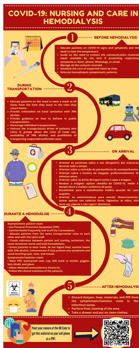
Figure 4 – Nursing Timeline